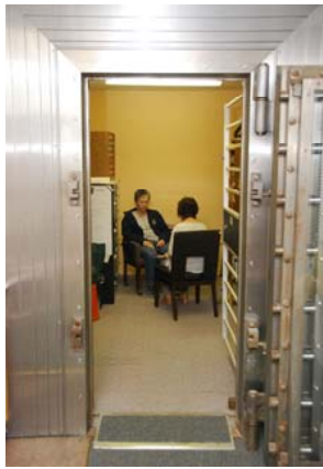
Practicing in the Vault